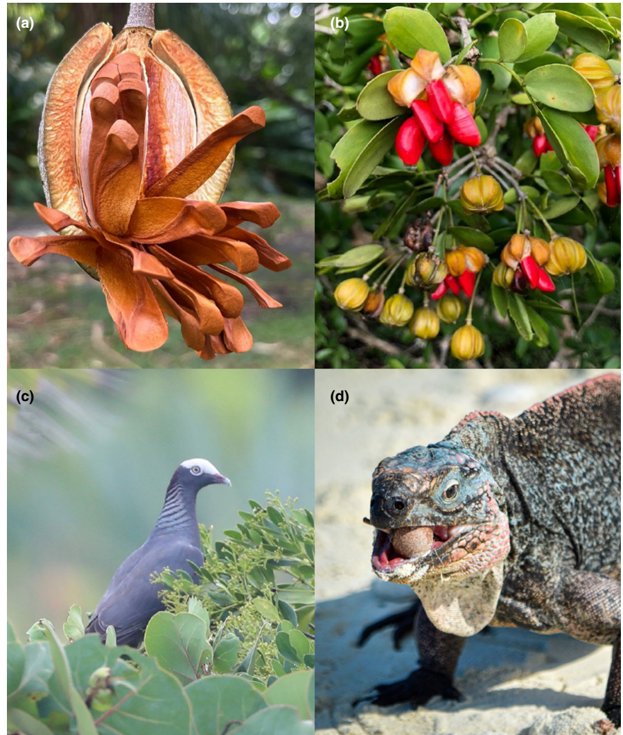
FIGURE 1 (a) Swietenia mahogoni (Caribbean mahogany): an example of a plant with abiotic dispersal syndromes (photo credit 1). (b) Guaiaecum sanctum (Holywood lignum-vitae): an example of a plant with zoochoric dispersal syndromes (photo credit 1). Plants with zoochoric dispersal syndromes can interact with frugivorous birds (c: Patagioenas leucocephala —White crowned pigeon; photo credit 1) or reptiles (d: Cyclura cychlura —Northern Bahamian rock iguana—photo credit 2). Mauro Galetti (photo credit 1) and Laís Lautenschlager Rodrigues (photo credit 2)

of volcanism (Lesser Antilles) and tectonic activity and uplift (Greater Antilles and the Lucayan archipelago), which exposed dry land for colonization by terrestrial organisms (Graham, 2003). Climatically, while the Caribbean archipelagos are primarily tropical, rainfall can be highly variable (529–2897 mm/year), with islands such as the Great Inagua Island and parts of Hispaniola having arid conditions (Beck et al., 2018; Fick & Hijmans, 2017). Overall, six ecoregions—tropical/subtropical moist broadleaf forests, tropical/subtropical dry broadleaf forests, tropical/subtropical coniferous forests, flooded grasslands/savannas, deserts/xeric shrublands, mangrove—are recognized in the Caribbean islands (Clark et al., 2021).